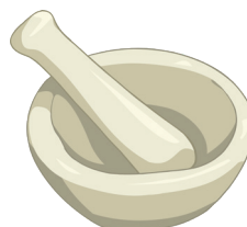
mortar and pestle